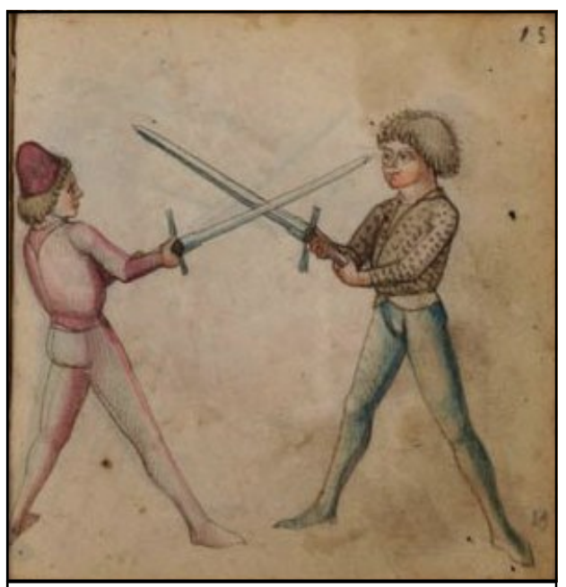
Figure 3: Bologna edition of Paulus Kal fol. 15r showing the Zornhau.

In figure 3 below the exact same orientation is shown; again, the defender's point is in front of the attacker's face.