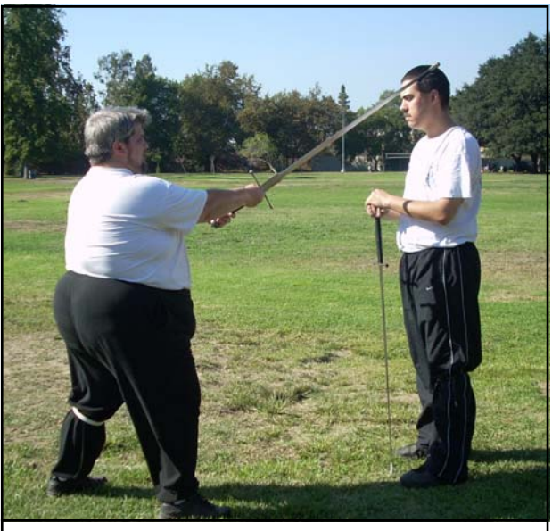
Figure 1: A Zornhau performed in the Vor.

Each of the three texts says that if, after the defender has displaced the attacker's cut, he notices that the attacker is soft in the bind, then the defender should remain in the bind (i.e., keep his sword against his opponent's sword) and thrust his point forward into the attacker.